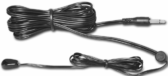
ITEM C: (4) 283M Mouse Emitters